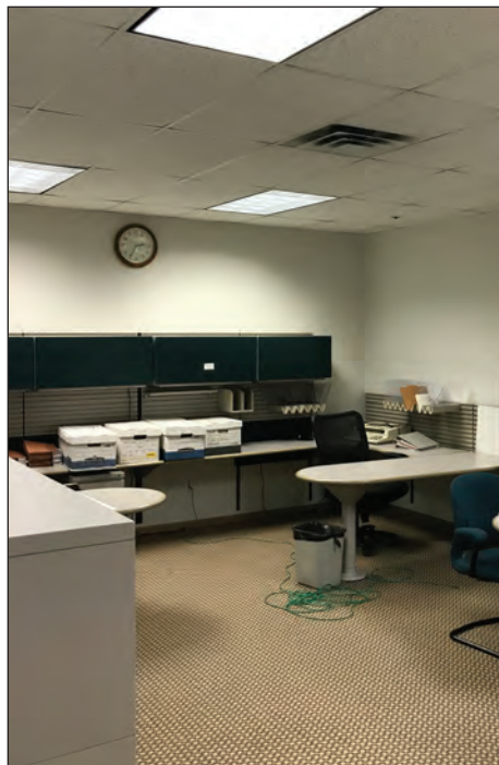
communal work areas