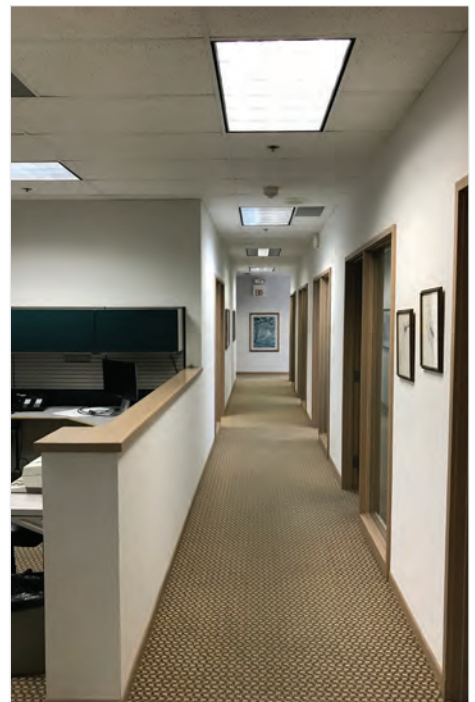
finished office areas