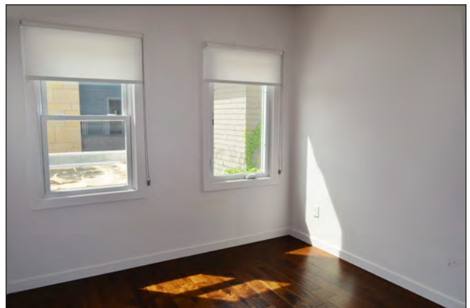
Bedroom with privacy shades