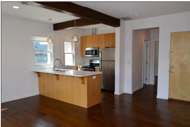
Kitchen with new stainless steel appliances