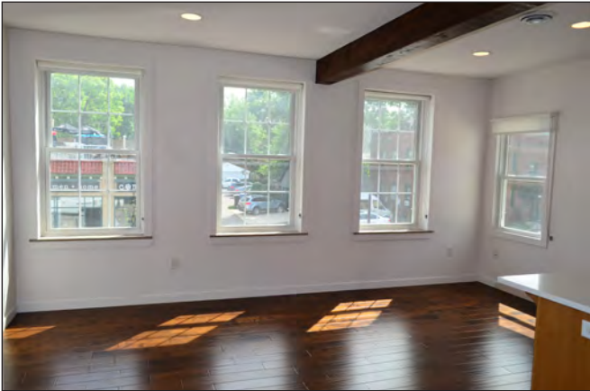
Great Room with large, south-facing windows