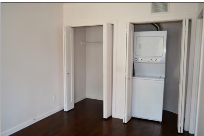
Closet / Stacked washer and dryer