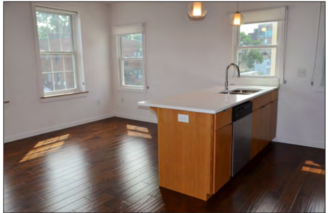
Island with breakfast bar